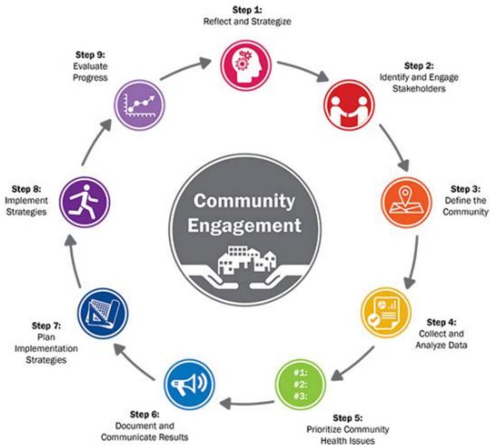
Figure 1 –ACHI 9 Step Community Health Assessment Process

According to the Patient Protection and Affordable Care Act (“ACA”), hospitals must perform a community health needs assessment either fiscal year 2011, 2012, or 2013, adopt an implementation strategy to meet the community health needs identified, and beginning in 2013, perform an assessment at least every three years thereafter. The needs assessment must take into account input from persons who represent the broad interests of the community served by the hospital facility, including those with special knowledge of or expertise in public health, and must be made widely available to the public. For the purposes of this report, a community health needs assessment is a written document developed by a hospital facility (alone or in conjunction with others) that utilizes data to establish community health priorities, and includes the following: (1) A description of the process used to conduct the assessment;(2) With whom the hospital has worked; (3) How the hospital took into account input from community members and public health experts; (4) A description of the community served; and (5) A description of the health needs identified through the assessment process.