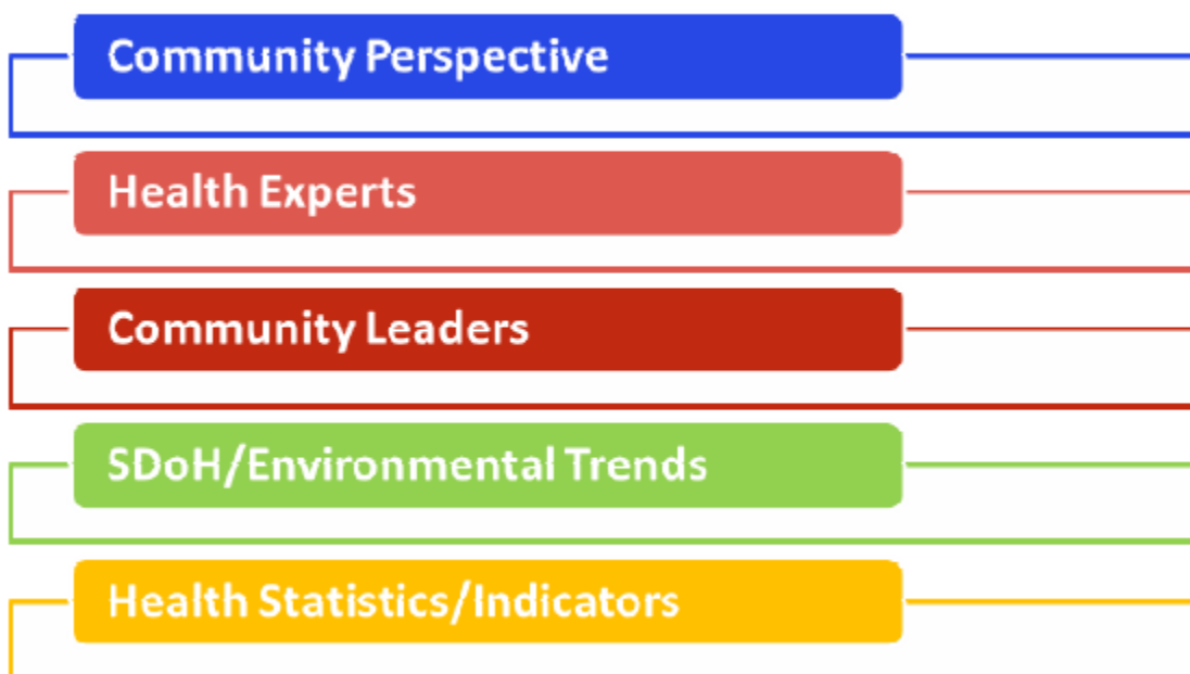
Figure 2 – 5-Step Assessment & Engagement Model

Data was collected from the five major areas outlined above to complete a comprehensive assessment of the community's needs. Data is presented in Section III of this summary and includes primary and secondary sources of data. The University of Maryland Rehabilitation & Orthopedic Institute participates in several local coalitions including, Baltimore City Mayor's Commission on Disability as well as partnerships with many community-based organizations. This assessment report was approved by the UM Rehab Community Health Leadership Team in June and by the Board of Directors on June 15, 2021.